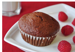
Choc. Chip Muffin